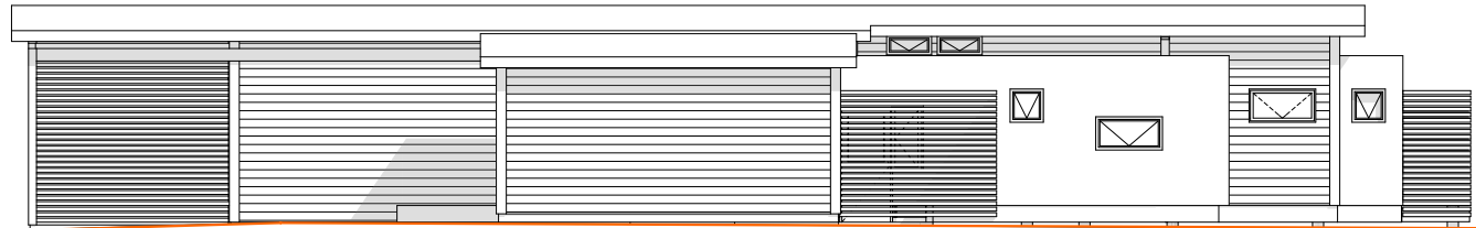
WEST ELEVATION scale 1:150