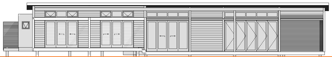
EAST ELEVATION scale 1:150